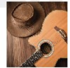
Country and Western Music and Dancing Friday Night