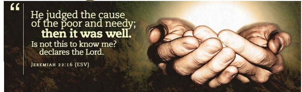
HELPING THE POOR AND THE NEEDY IS HOW WE COME TO KNOW THE LORD

أحد ألابرار والصديقين Sunday of the Righteous & Just