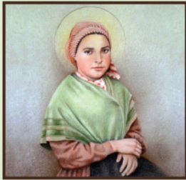
Truth to Inspire Series Audio Stories of the Saints by Quiet Waters

Bernadette may have been a poor, uneducated, sickly French girl, but her visions of the Blessed Virgin at Lourdes, and her subsequent courage to follow out the requests of Our Lady, demonstrate to all of us, young or old, rich or poor, that our Lady “doesn’t promise us happiness in this world, but in the next.” Listen and be inspired!