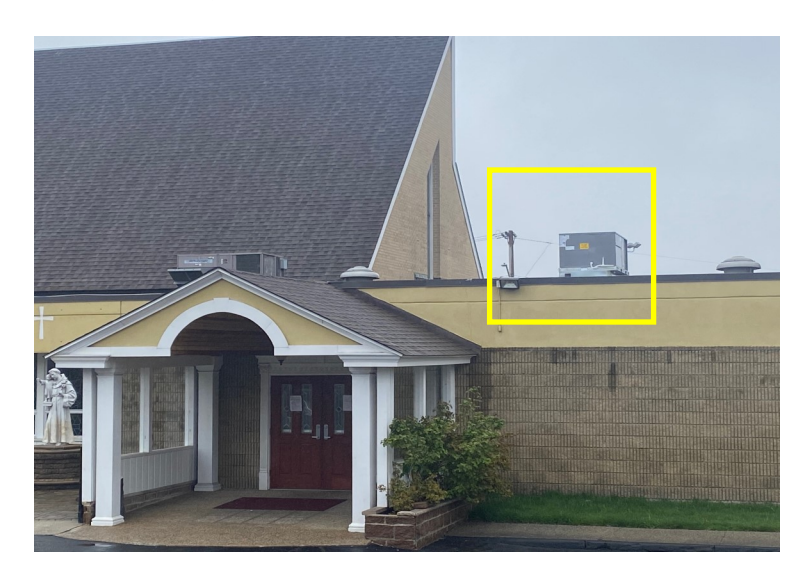
Rectory Flatt Roof: Water Damage and Leak into the Office-Kitchen and Dining Room —In Progress