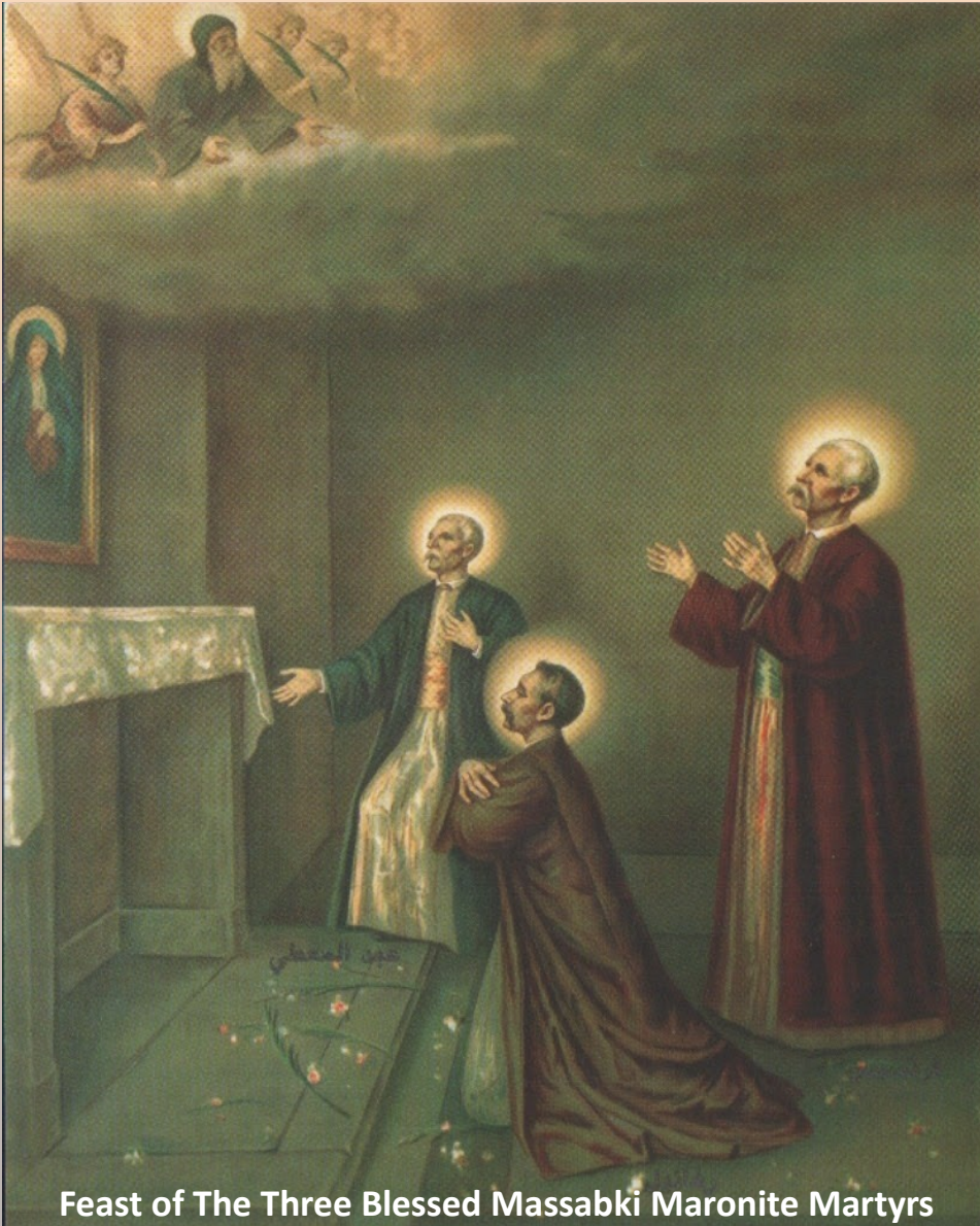
Feast of The Three Blessed Massabki Maronite Martyrs