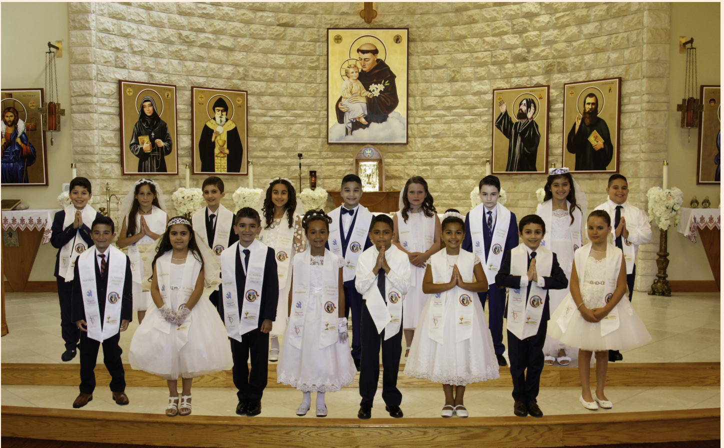
FIRST COMMUNION CLASS 2019 –2020