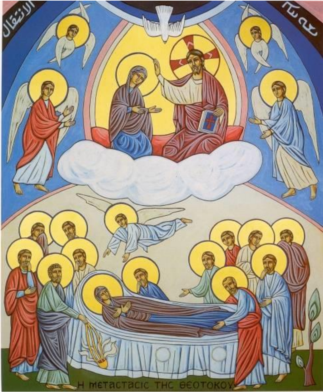
Saint Anthony Maronite Catholic Church