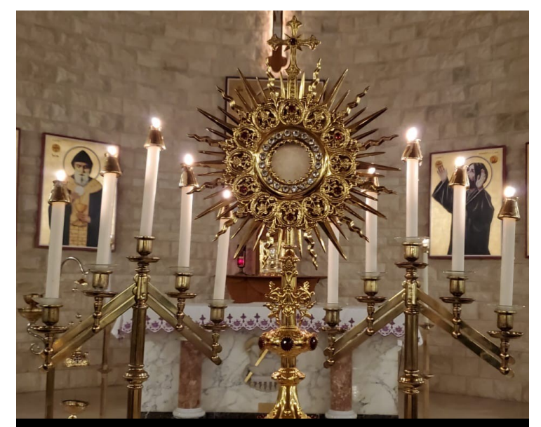
Every Thursday, 9:30am-12pm

WEEKLY BULLETIN: SEASON OF PENTECOST—ST. ANTHONY MARONITE CHURCH - AUGUST 9, 2020