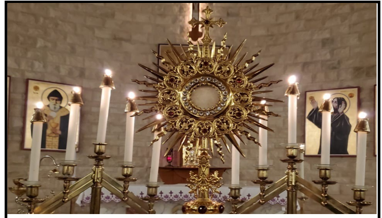
ADORATION OF THE BLESSED SACRAMENT Every Thursday 9:30 am- 12 pm