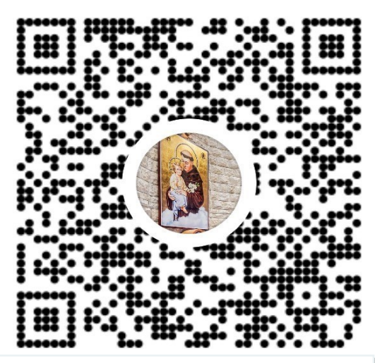
Venmo your Parish 1– Scan the QR code. 2– Choose the amount 3– Use the Memo to indicate which account the contribution is made towards. (e.g. Weekly Contribution, Energy needs...)

WEEKLY BULLETIN: SEASON OF PENTECOST—ST. ANTHONY MARONITE CHURCH - NOVEMBER 01, 2020