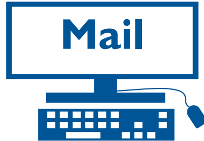
To your inbox

Sign Up at www.pilotbulletins.net/sign-up