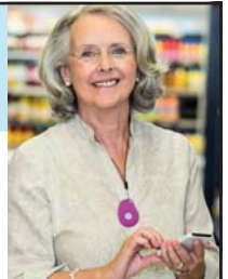
GPS Mobile Above

No Contract • No Fees • Easy Setup • md-medalert.com CALL 800-890-8615