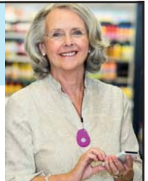
GPS Mobile Above

No Contract • No Fees • Easy Setup • md-medalert.com CALL 800-890-8615