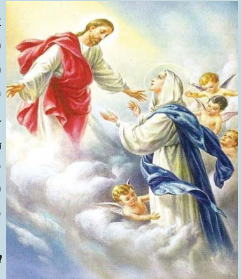
Feast of the Assumption of Mary