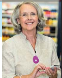
GPS Mobile Above

No Contract • No Fees • Easy Setup • md-medalert.com CALL 800-890-8615