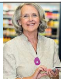
GPS Mobile Above

No Contract • No Fees • Easy Setup • md-medalert.com CALL 800-890-8615