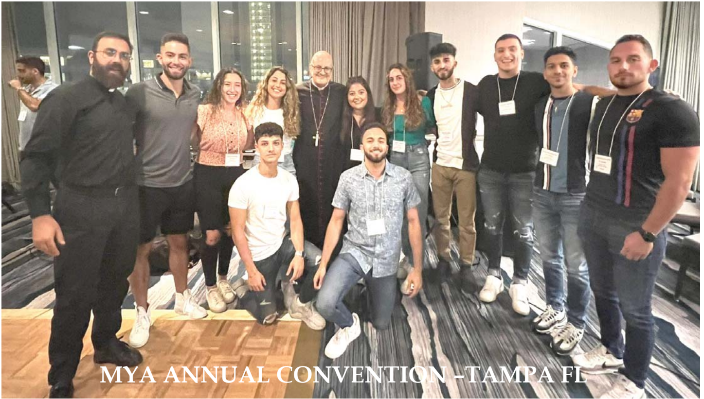
MYA ANNUAL CONVENTION - TAMPA FL