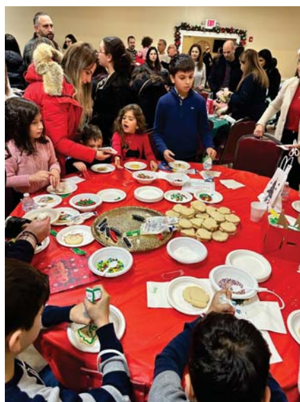
Kids CHRISTMAS PARTY