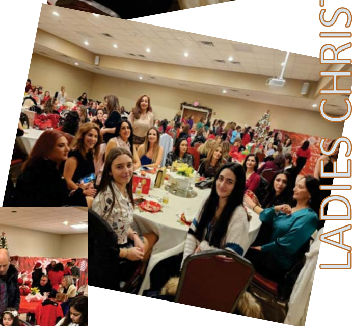
LADIES CHRISTMAS PARTY