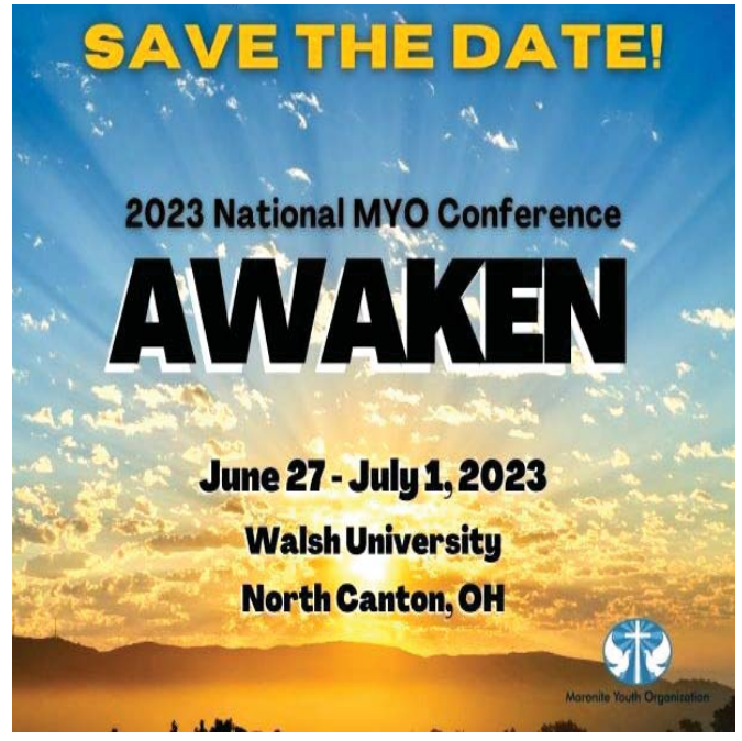
Cost : $400 ($380 early bird special if you register before our early bird deadline)

WEEKLY BULLETIN: THIRD SUNDAY AFTER EPIPHANY- ST. ANTHONY MARONITE CHURCH - JANUARY 22, 2023