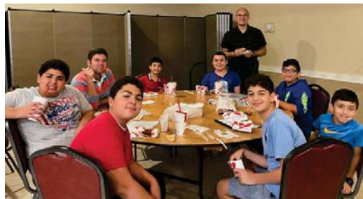
Our Knights of the Altar enjoyed lunch together after their training