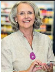
GPS Mobile Above

No Contract • No Fees • Easy Setup • md-medalert.com CALL 800-890-8615