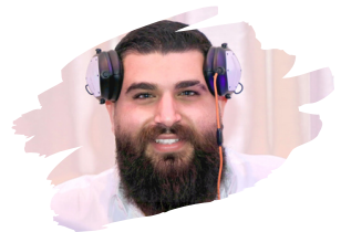
DJ Roy C